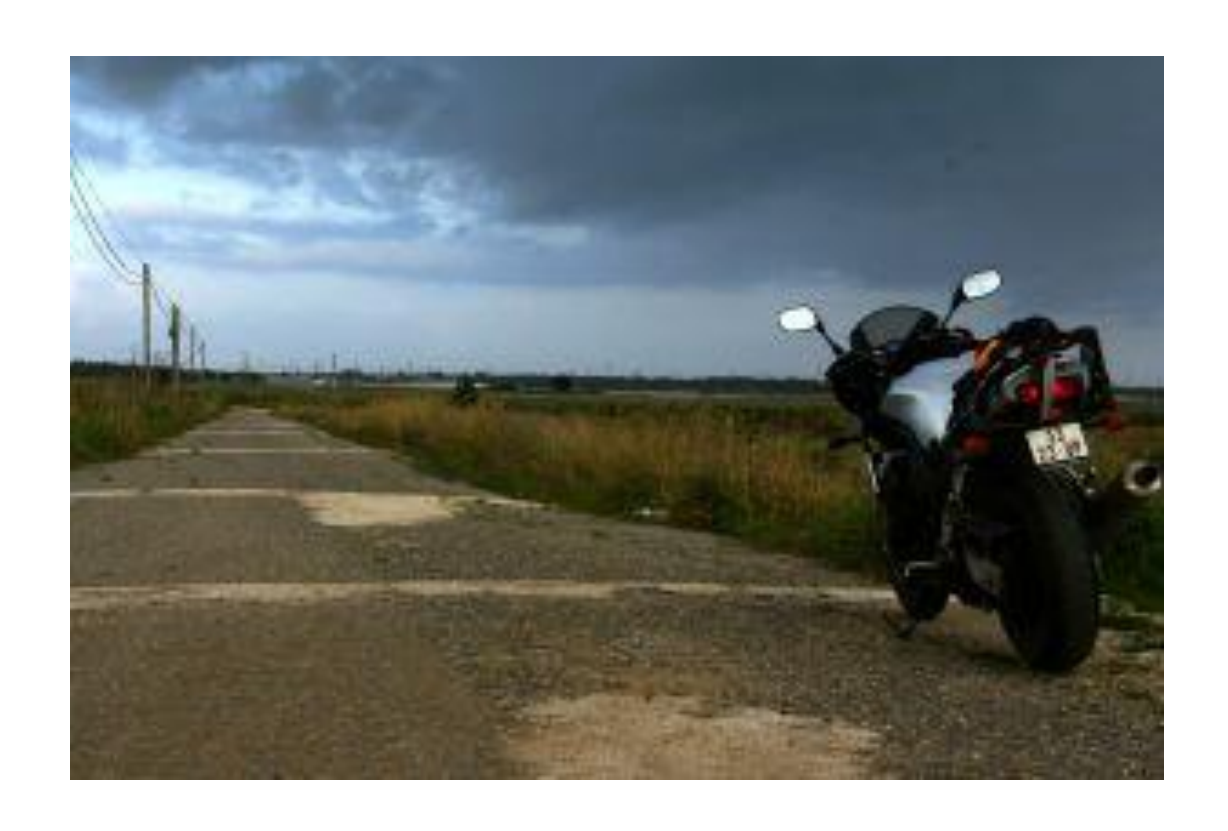
Destiny, Purpose And Your Future

If you believe in destiny then you are a lot better off than you have ever imagined and everything that is happening with you no matter how good or bad it is, is going to come down to a single phenomenon and that is to bring you to your destiny. Get all the info you need here.